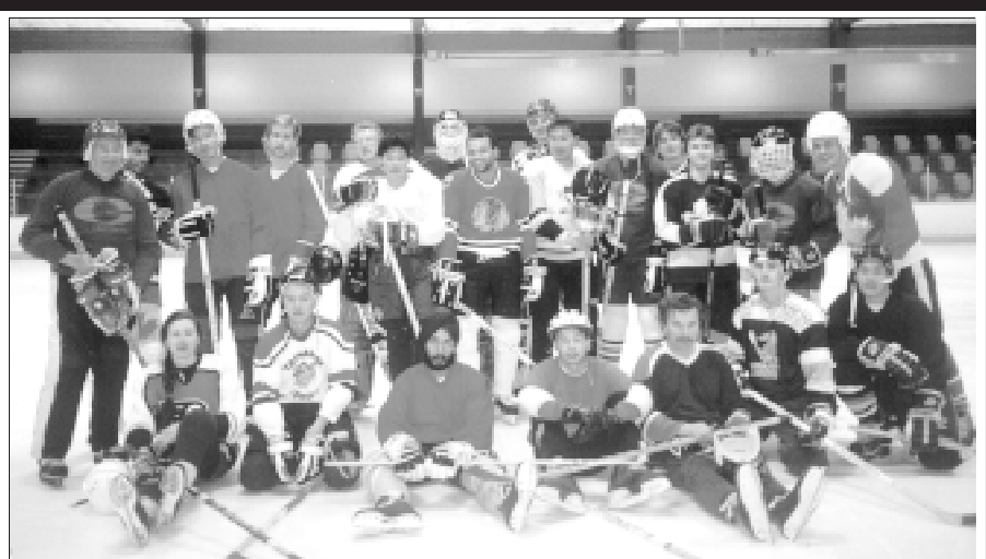
Friday afternoon Geography hockey, Spring, 1992.