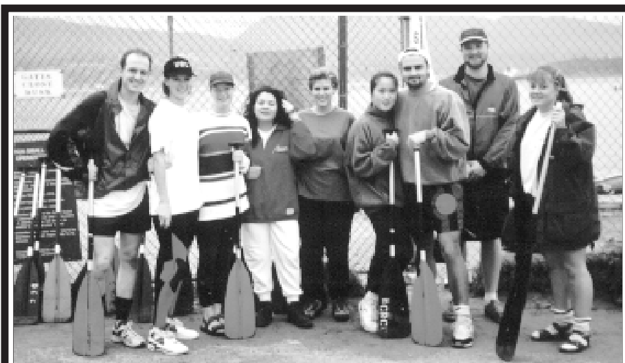
UBC Geography team at the Day of the Longboat Competition, 1995.