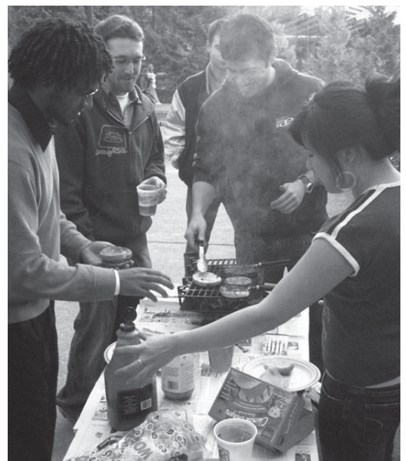
Students enjoy the last BBQ of the year

Some great memories and friends were made through the GSA this year, and we know that the spirit of the club and its members will continue to grow in coming years! Several execs plan to return for next year's GSA council, which will indubitably create a very rich and exciting atmosphere for incoming and returning geography students! If there are any inquiries or comments, please feel free to contact us at ubcgsa@hotmail.com .